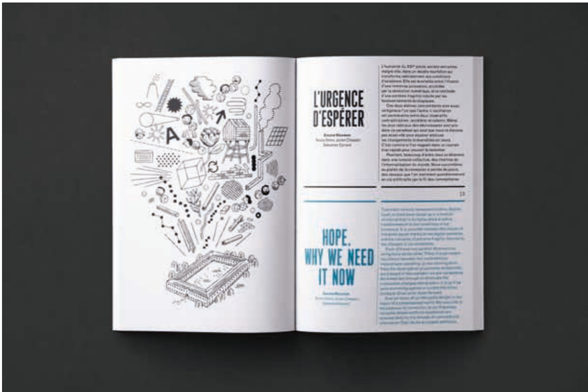
Template of the catalogue

The exhibition catalogue is a collective work. The first part is composed of texts written by ten authors from the Human Sciences. Thanks to their different disciplines, the aim is to deepen the ideas that emerge of the production of those places.