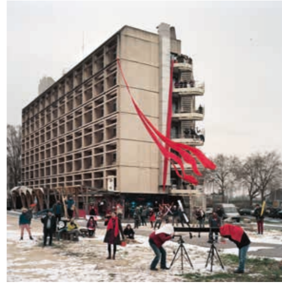
Le 6B, Saint-Denis