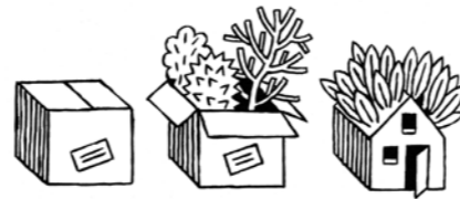
Drawings by Jochen Gerner.