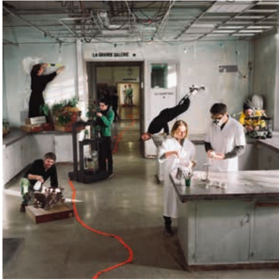
L'Hôtel Pasteur, Rennes