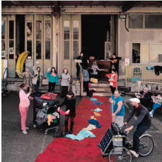
Le Tri Postal, Avignon