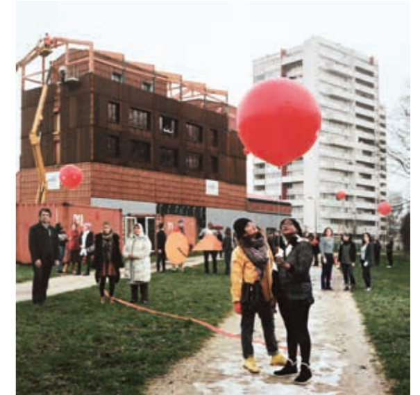
Les Ateliers Médicis, Clichy-sous-Bois – Montfermeil