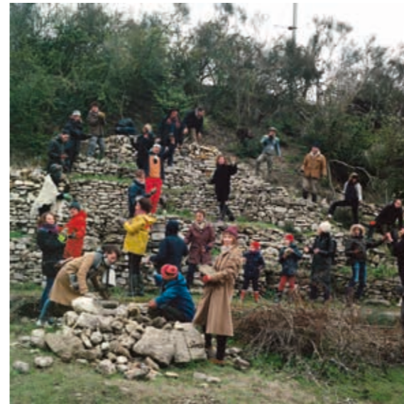
La Ferme du Bonheur, Nanterre