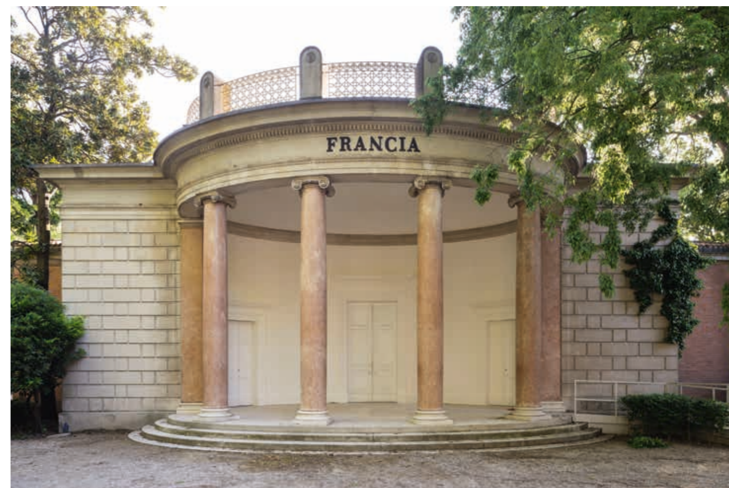
French Pavilion