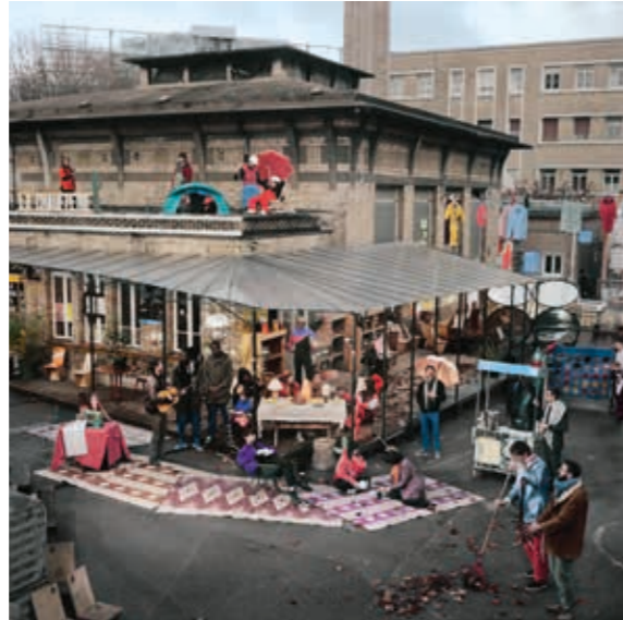
Les Grands Voisins, Paris