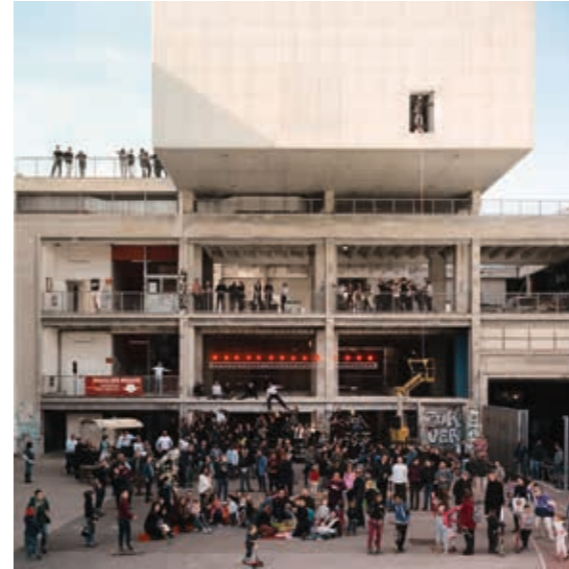
La Friche la Belle de Mai, Marseille