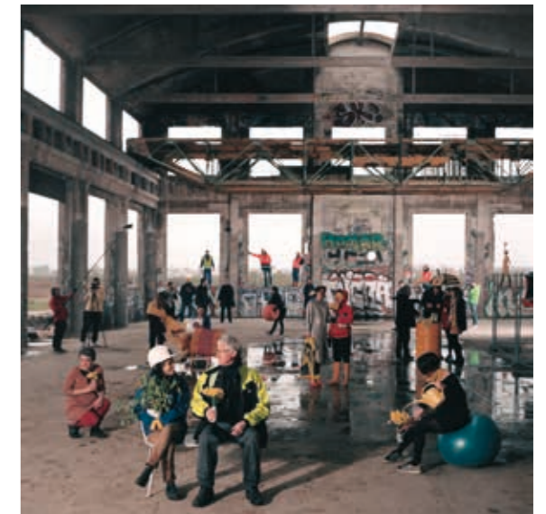
La Grande Halle, Colombelles