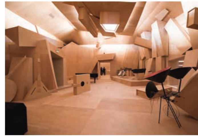
Xavier Veilhan, Studio Venezia (2017) – ©Veilhan/ADAGP, Paris, 2017