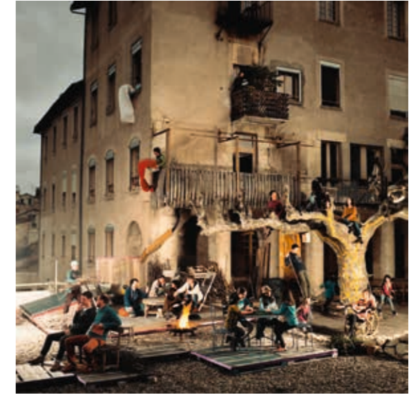
La Convention, Auch