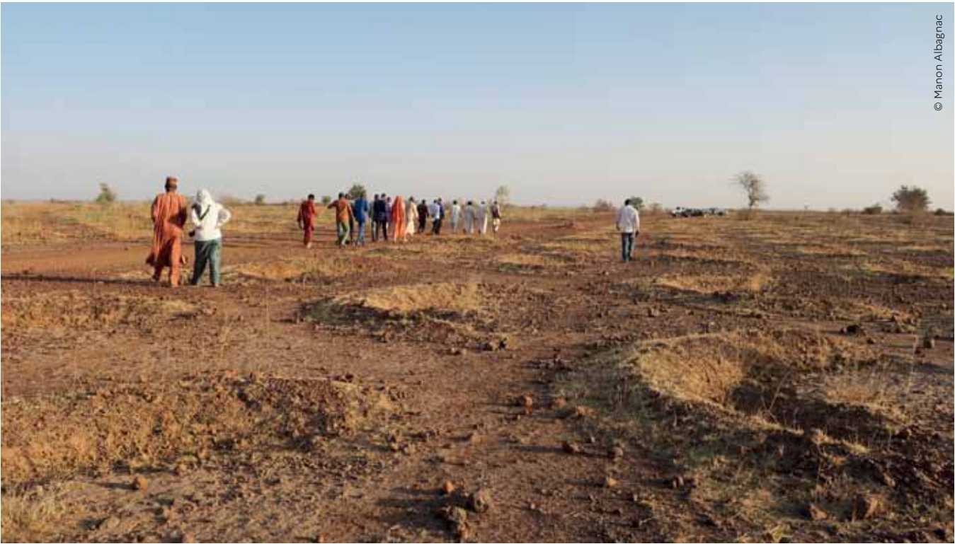
Half-moons, restoration of a pastoral zone, Niamba plateau, Torodi, Niger, 2017

change. Furthermore, increasing inequality, land and resource grabbing with increasingly depleted supply, and the sometimes difficult coexistence of agriculture and pastoralism also make land degradation a source of conflict .