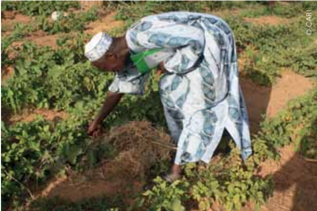
Local counsellor visiting a market gardening area, Sakal, Sénégal, 2007