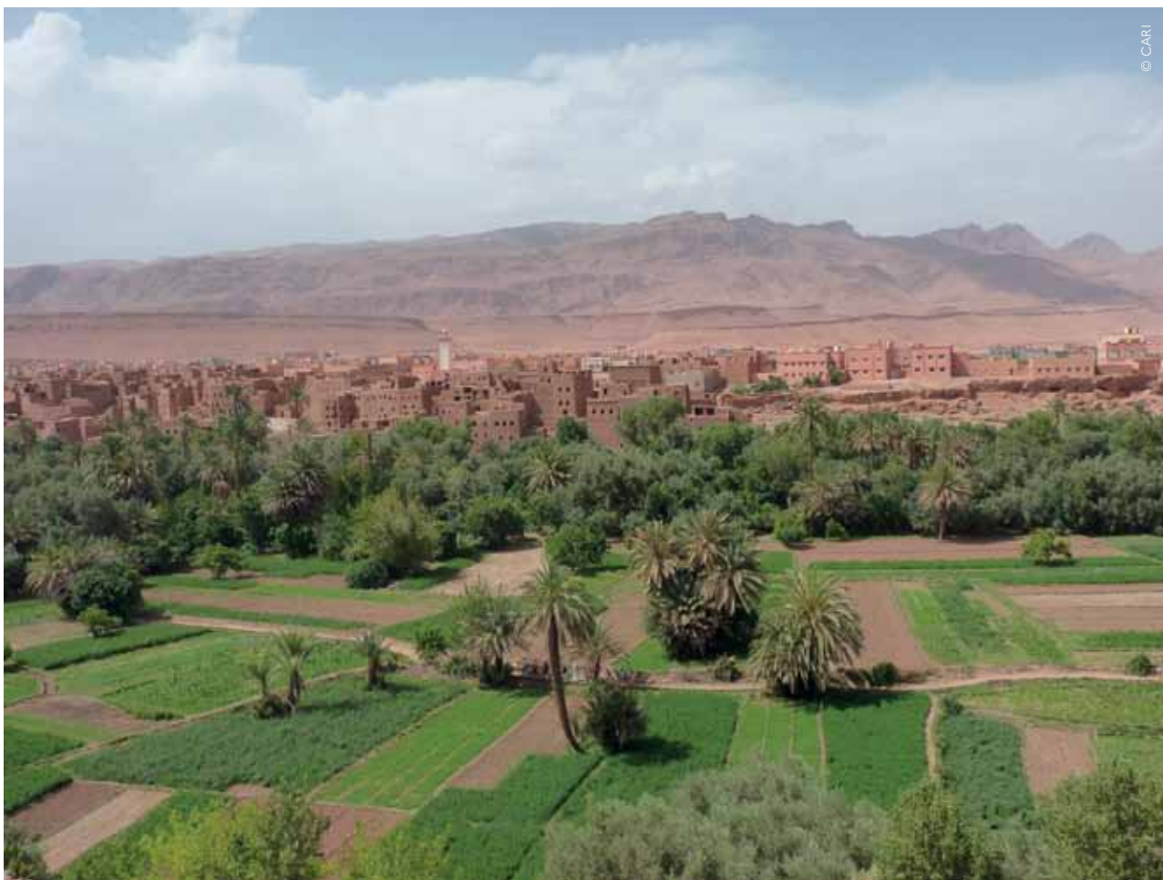
Oasis landscape, Dades valley, Morocco, 2013