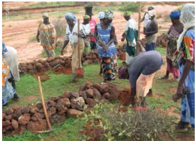
Community mobilization to build stone barriers, Landou, Mali, 2009