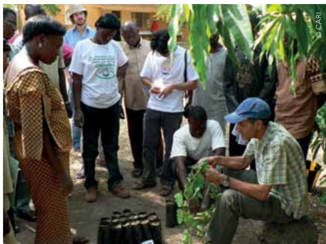
Technical training on plant cuttings, Ouagadougou, Burkina Faso, 2007

4. Promote agroecology as a tool for combating land degradation by documenting its multi-dimensional impact (economic, social, environmental, food and nutrition, public health aspects, etc.);