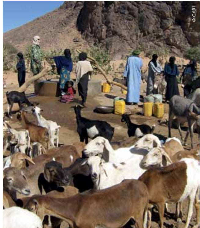
Pastoral well, Bagzam, Niger, 2007

• Sahel Alliance: launched in 2017 on France's initiative, the Sahel Alliance is an intergovernmental organization that is composed of the main donors operating in the region, including several European countries, the European Union, the United Nations Development Programme (UNDP), the World Bank and the African Development Bank (AfDB). It works to respond to the challenges faced by the Sahel G5. It targets its actions in priority sectors: education and employment of youth, agriculture, rural development, food security, energy and climate, governance, decentralization and basic services, and interior security.