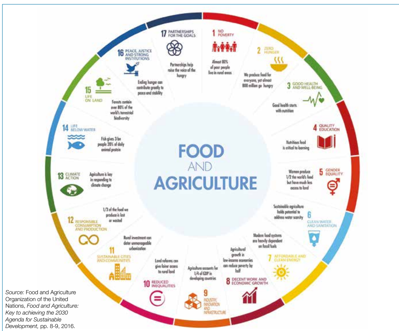
Figure 1. Agriculture and food at the heart of the 2030 Agenda for Sustainable Development

food security. The importance of family farming for France is highlighted in the orientation and programming law No. 2014-773 of 7 July 2014 on development and international solidarity policy, which recalls that France promotes family farming that creates wealth and jobs, supports food crop production and respects ecosystems and biodiversity. For this type of farming to create wealth and in order to meet the challenge of 9.8 billion