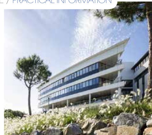
Left to right : CHU d'Amiens – Centre Antoine Lacassagne, Centre de lutte contre le cancer de Nice – Institut de Cancérologie de l'Ouest, Nantes